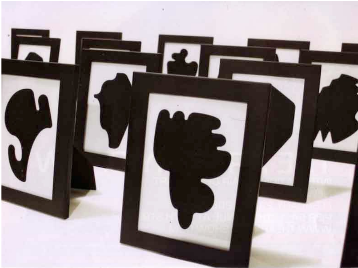
LEFT AND ABOVE ALL BY ALLAN MCCOLLUM THE SHAPES PROJECT (DETAILS, 2006) SMALL, FRAMED PRINTS PRINTS, 8 1/2 X 11 1/2 IN.

“ McCollum's The Shapes Project gives the effect of a tidal wave of plotted options—an antiquated computer, circa WarGames, with an almost-manageable rate of output.”