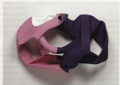
5. Below: Vincent Fecteau, Untitled , 2010, acrylic on papier-mâché, 27 x 44 x 12 1/2".

2021 S WABASH AVE CHICAGO IL 60616 +1 (312) 226 2223