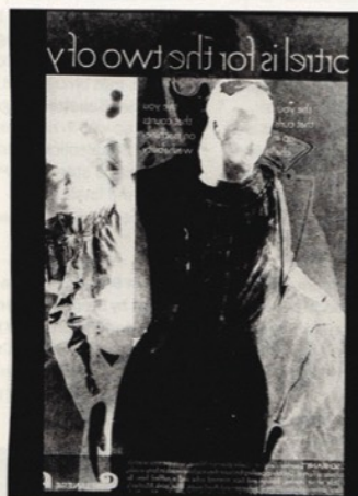
3. Robert Heineken, untitled , 1966, black-and-white framed photogram, 11 1/4 x 8 1/4". From the series "Are You Rea," 1966-68. From "They Have Not the Art to Argue with Pictures."