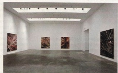
4. Above: View of Mark Grotjahn, "Seven Faces," 2010, Blum & Poe, Los Angeles.