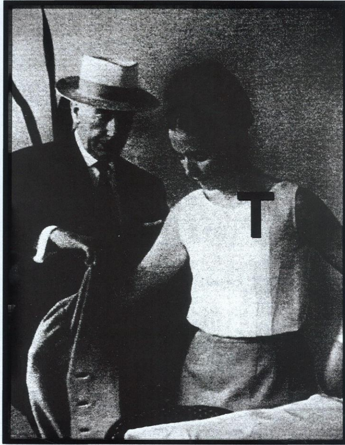
System of Display, T (NIGHT)/Joan- Marie Straub, Not Reconciled, 1965), 2011, silkscreen ink on glass and mirror, 63 3/8 by 48 7/8 inches.