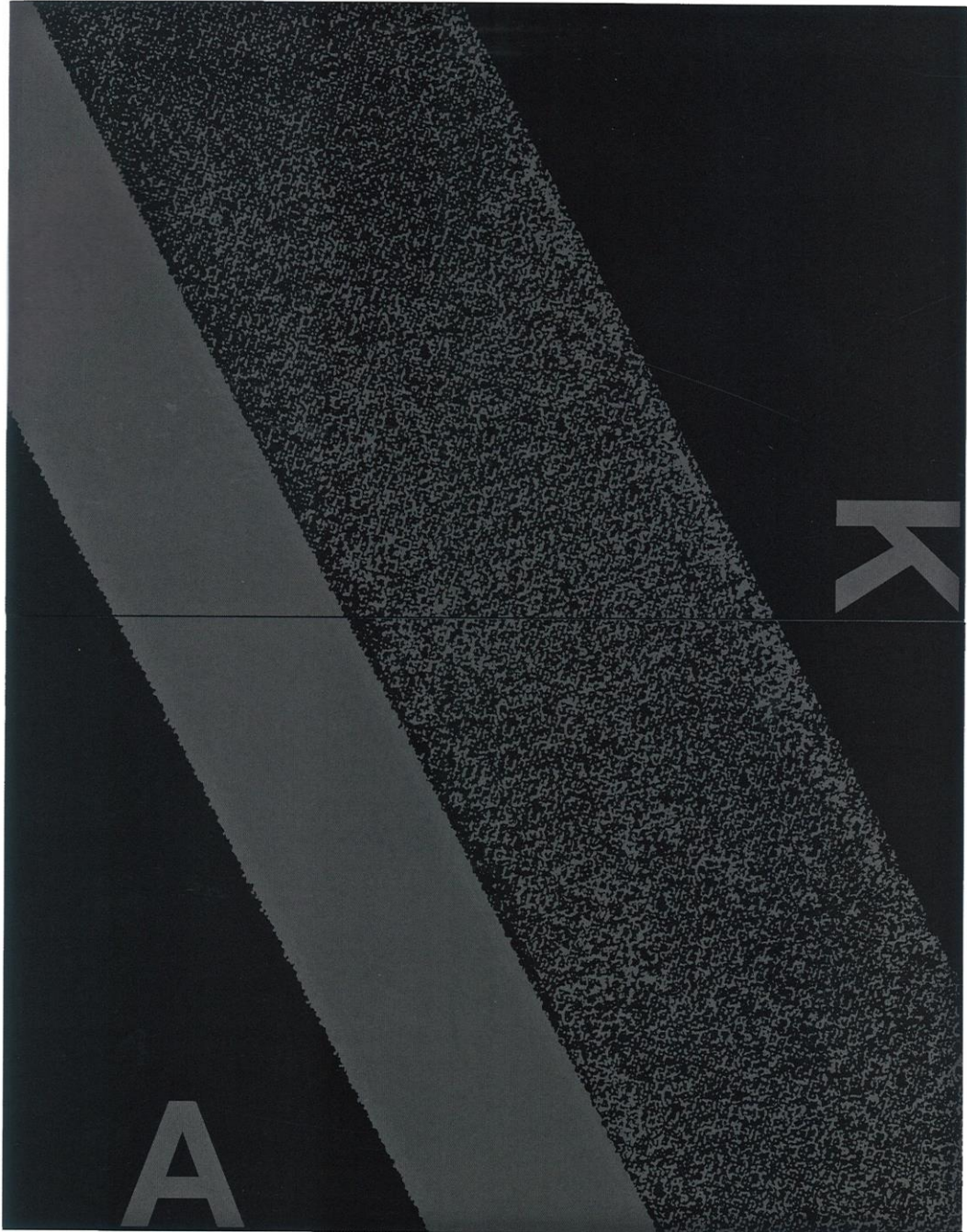
Black Dada (K/A) , 2012, silkscreen ink on canvas, diptych, 96 by 76 inches overall.